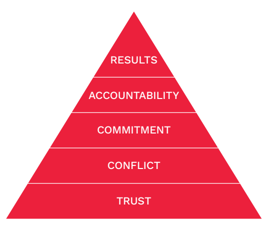
The Five Behaviors Model

The experience is completed through a half-day training session, led by a trained Five Behaviors expert. This session includes a walkthrough of the Personal Development profile, breakout activities, and group discussion.